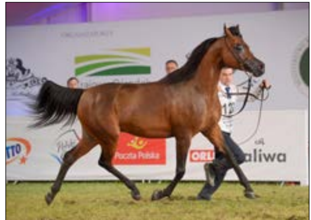
SENIOR MARES - EMANDILLA OM EL SHAHMAAN X ESPADRILLA - B/O: MICHAŁÓW STUD