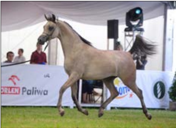
YEARLING FILLIES - EL MEDIDA MORION X EL MEDARA - B/O: MICHAŁÓW STUD