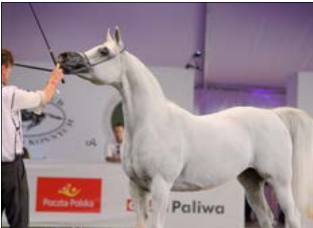
SENIOR MARES - PSYCHE KREUZA EKSTERN X PALLAS-ATENA - B/O: CHRZYNNO PALACE STUD