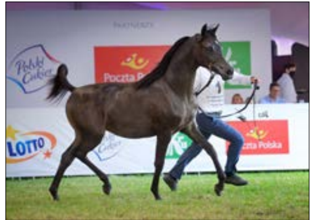
YEARLING FILLIES - LAURA KL WADEE AL SHAQAB X LILI PS B/O: KLIKOWA ARABIANS