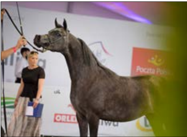
JUNIOR FILLIES - PAPTROTNIA ELGAST X PAEKSA - B/O: LECH BŁASZCZYK