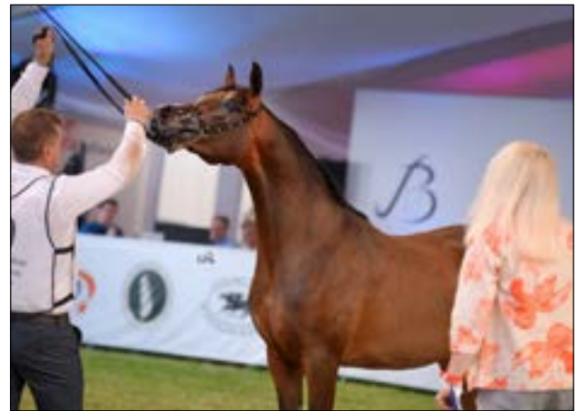
JUNIOR FILLIES - EL FARIDA RFI FARID X ESMETA - B/O: ALICJA NAJMOWICZ